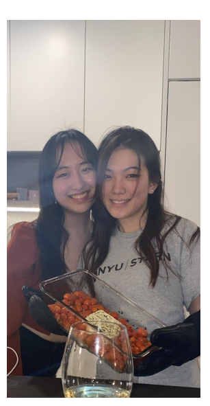
Senior Send-off Girls Night