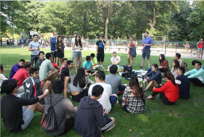
Freshman Central Park Outing